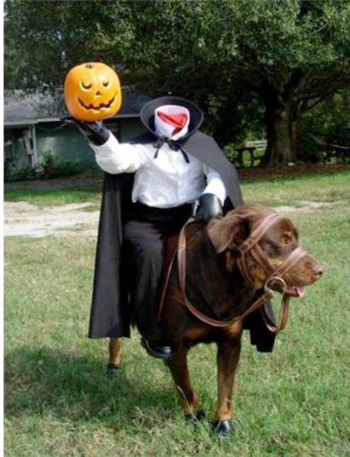
"How'd he do that?"