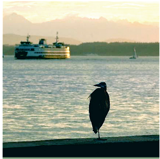
Early WSMTA 2008 Conference goer, waiting for the Bremerton ferry as it arrives in Seattle.